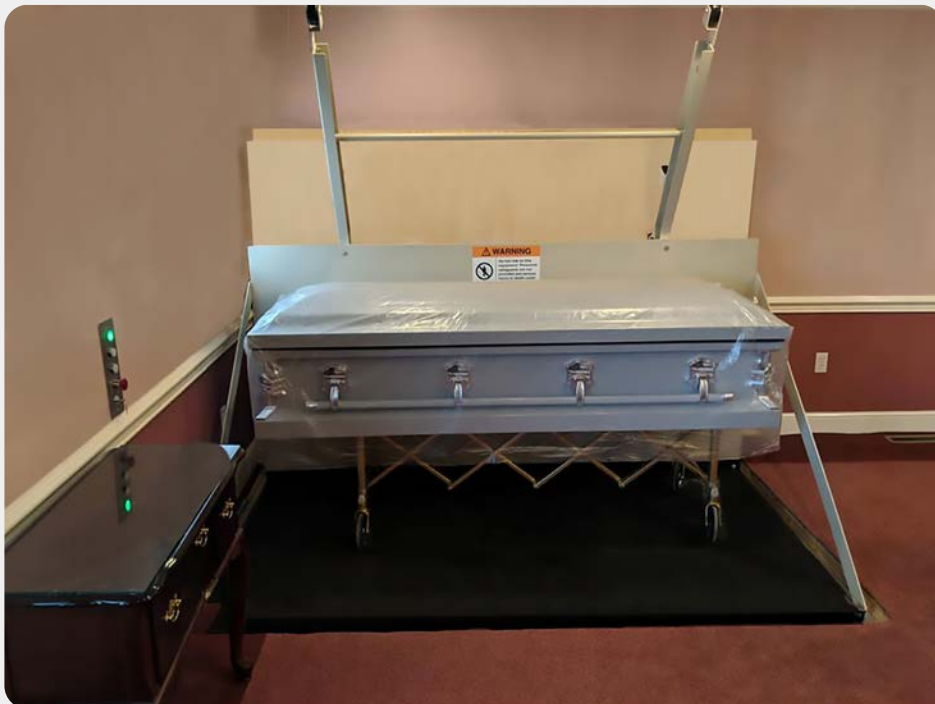
Telescopic mast (model 1520) in standard Ivory shown with hatch door