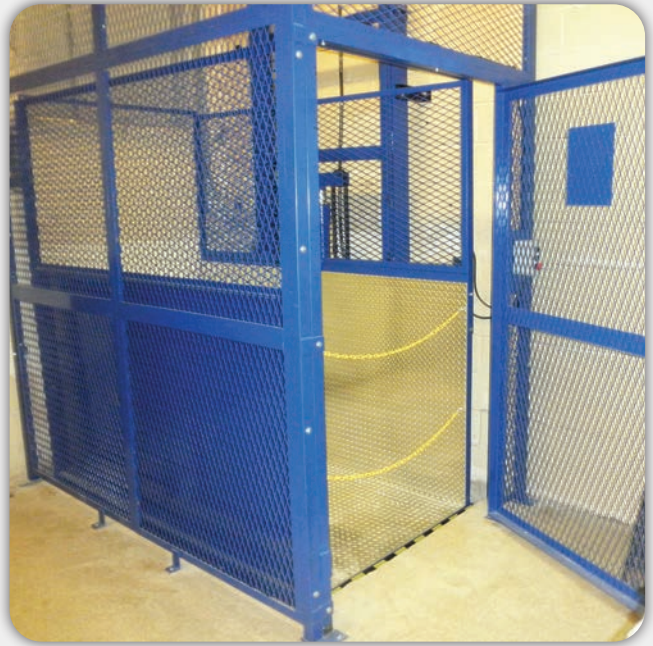
Expanded metal single swing gate and enclosure (model 1320) in custom color

A non-rated code compliant enclosure can be provided by the VRC manufacturer. Please see VRC Design Guide for more details.