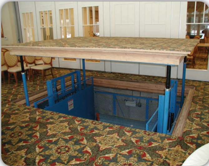
Telescopic mast (model 1520) in custom color shown with hatch cover