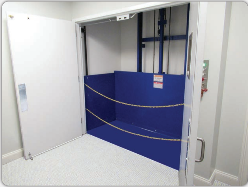
Single mast (model 1320) in custom color with safety chains