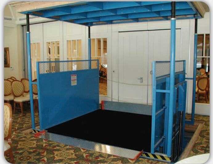
Telescopic mast (model 1520) in custom color shown with hatch cover at top landing with ramp