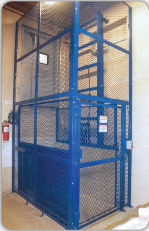
Expanded metal single swing gate and enclosure (model 1320) in custom color