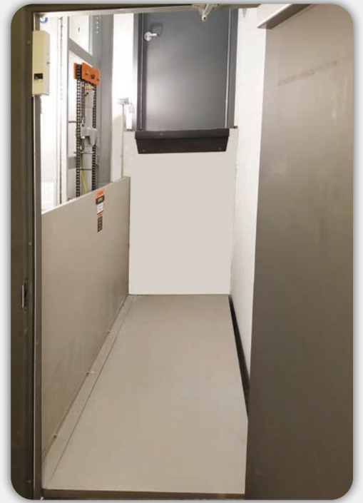
Single mast (model 1320) in standard Ivory