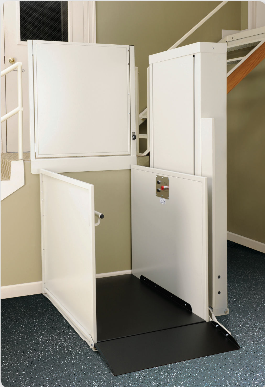
Shown with optional elevator style controls