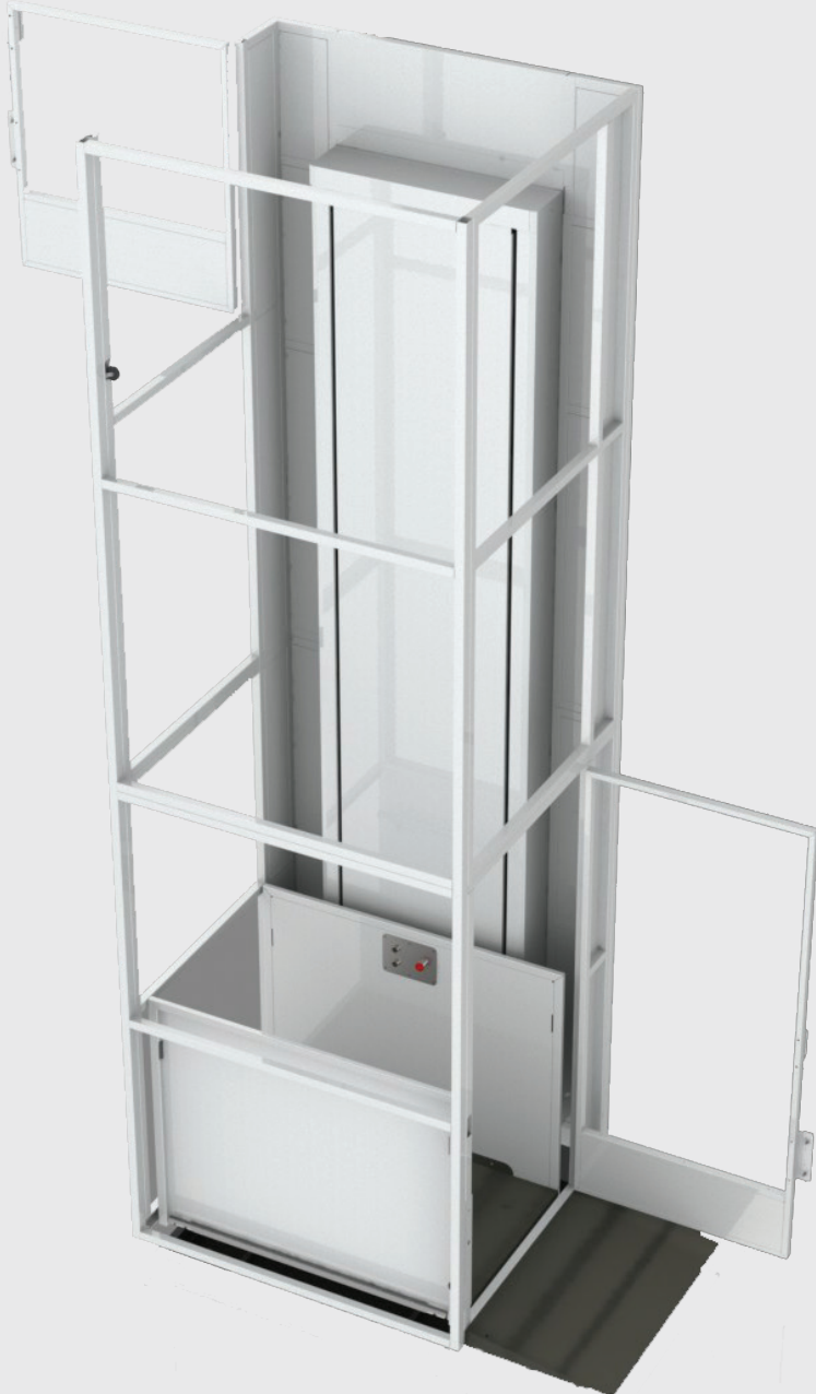
VPL-ELP shown with acrylic enclosure infill panels

VPL-EL & VPL-ELP for Residential & Commercial Applications