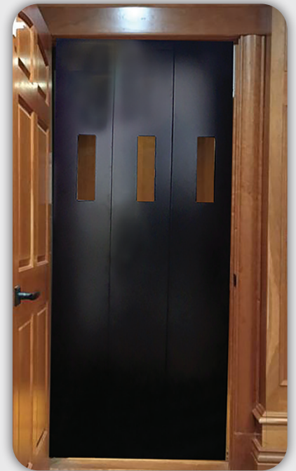
Symmetry Safety 3-Panel Door with Clear vision panels