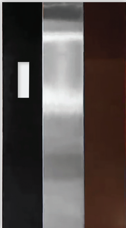
Shown in Black with vision panel, Brushed Stainless Steel and Vintage Bronze