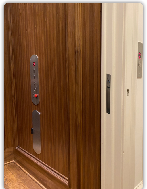
Symmetry Locking Device mounted in door frame