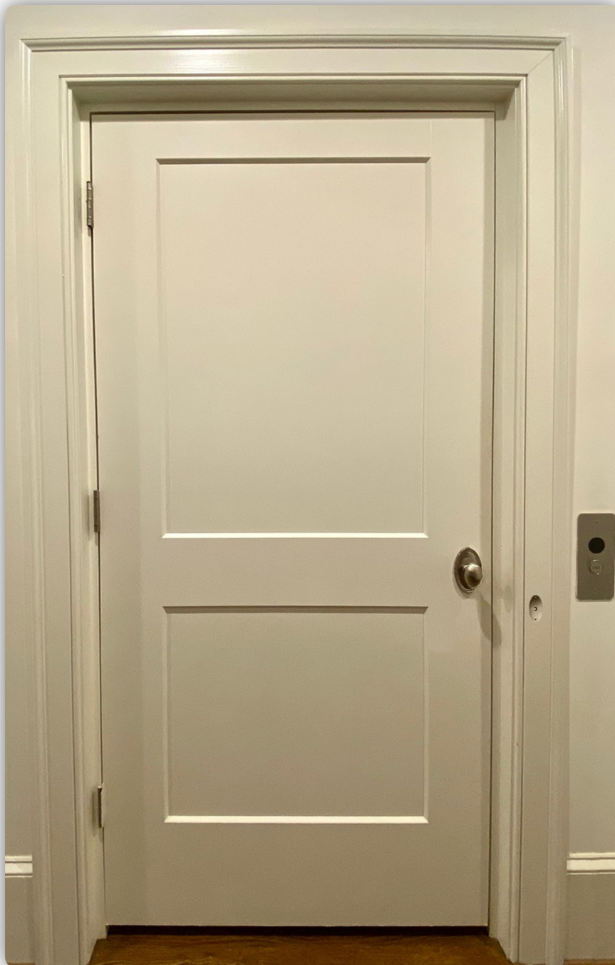
Flush door frame with key cover (door and frame by others)

This Symmetry lock solution, designed specifically for the home elevator market, provides peace of mind and out of sight installation.