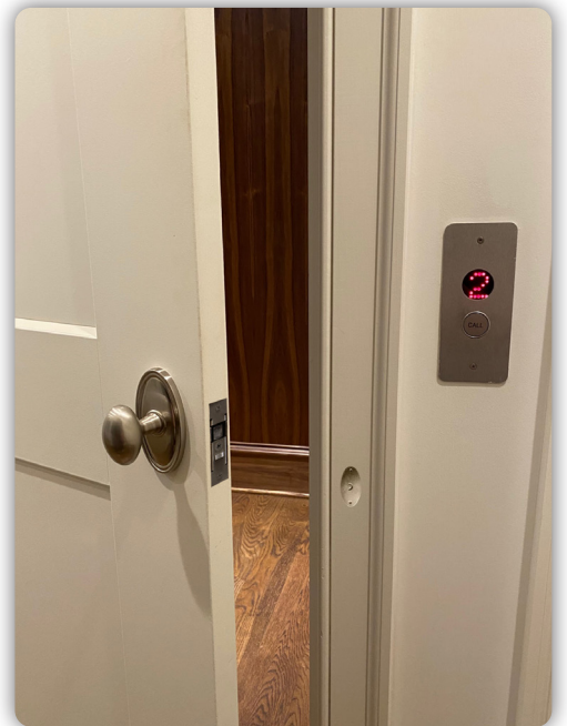
Latch mounted in door slab