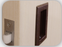
Roller Ball Catch & Recessed Pull (optional)