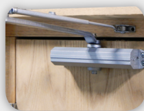
Delay Action Door Closer (optional)