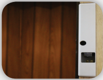
Electro-Mechanical Interlock (EMDL)