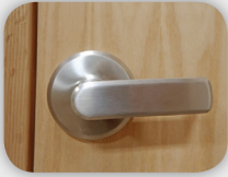
Dummy Handle (optional)*