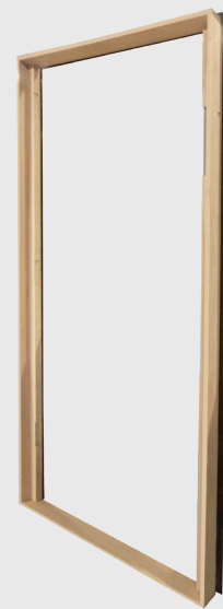
Flush Frame Front View