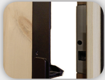
Latch Guard (Exterior View)