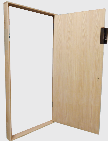
Standard Flush Door Package