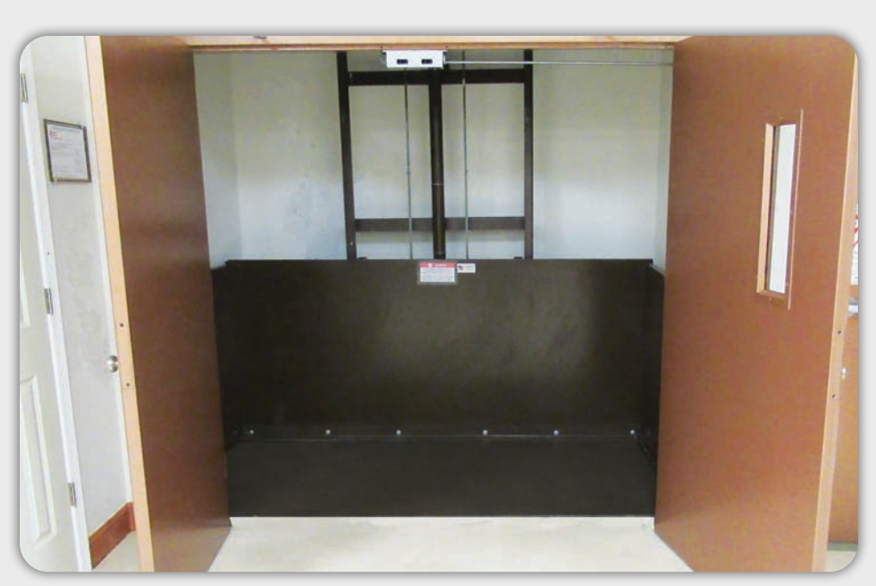
Single mast casket lift (model 1320) in custom color with fire-rated double swing doors