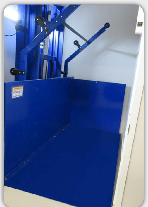
Telescopic casket lift (model 1520) in custom color