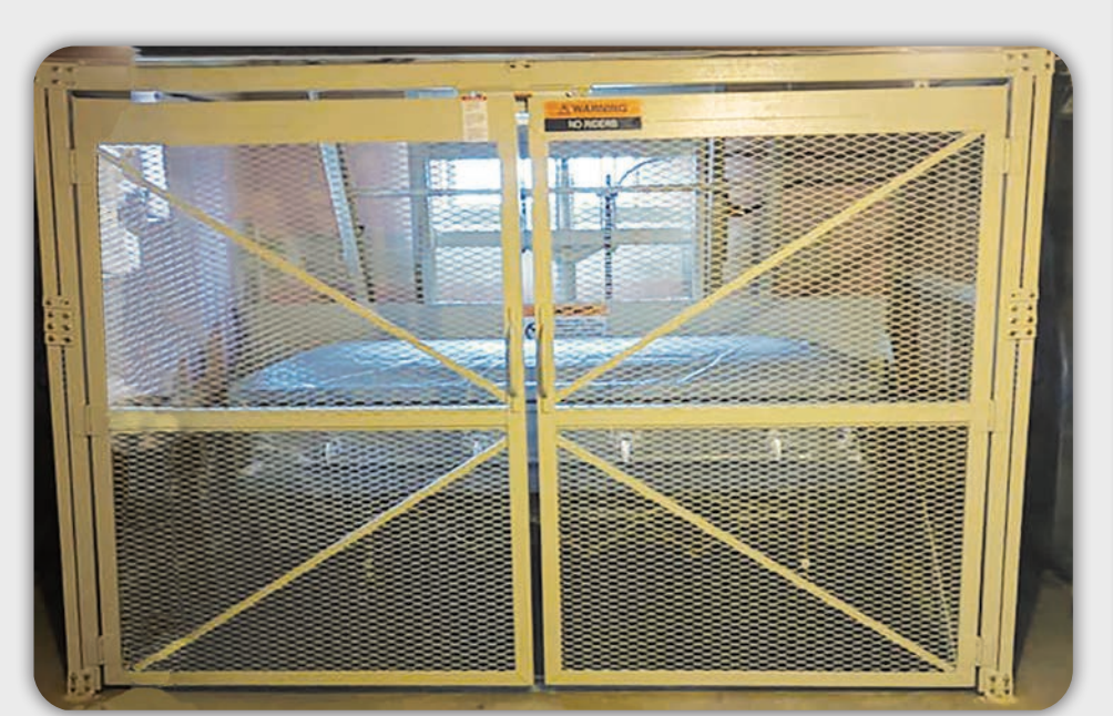
Double swing expanded metal gate enclosure (model 1520) in custom color