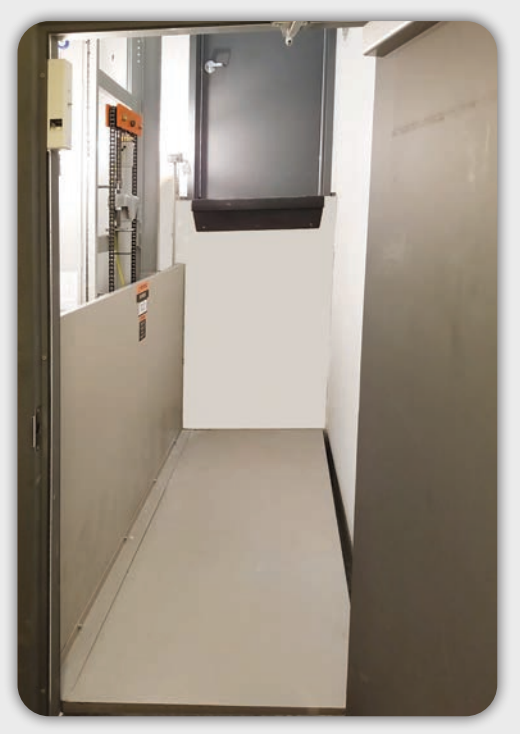
Single mast casket lift (model 1320) in standard Ivory