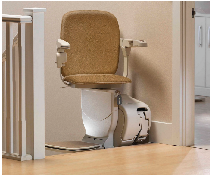
The seat swivels to face the top landing, blocking the stairs behind you, for added safety.