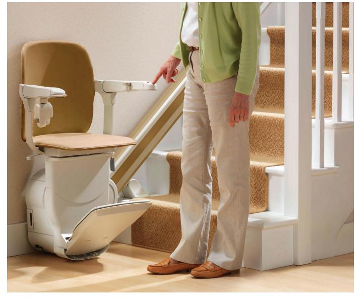
Simply press a button to fold and unfold the Siena's footrest, no need to reach down or bend over.