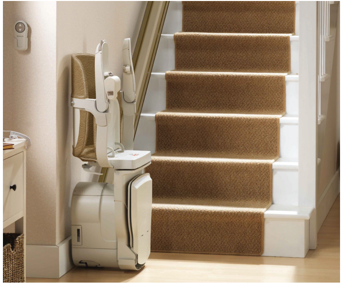
With its narrow rail and slim design, this stairlift takes up little room. A remote at each landing allows the chair to be called or sent away.

The slim-line rail sits close to the wall and was designed for narrow stairs with a door at the top, making the Siena ideal for basement stairs. With constantly recharging batteries to ensure that your stairlift is always ready for use, a wide seat and footrest, and optional retractable rail (if the rail protrudes at the bottom of the stairs), the 600 Siena is a class-leading choice from Stannah.