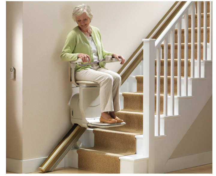
A gentle hand on the control sends the Siena smoothly up or down the stairs.