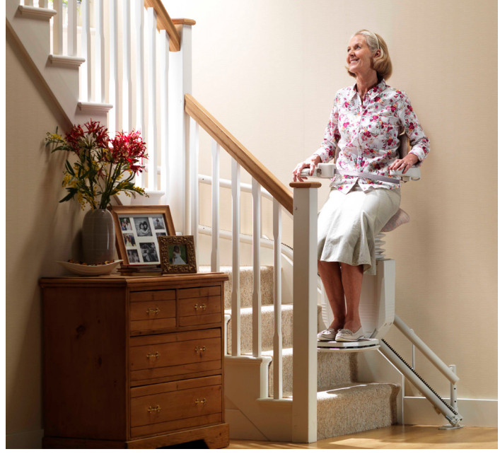
Glide upstairs on your Sadler, safely supported by the reclining seat. Upstairs, the Sadler travels a short distance onto the landing, for safety.