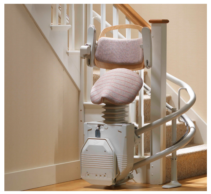
Easy folding leaves plenty of room for others to use the stairs. The footrest folds up when one armrest is raised.

The Stannah 260 Sadler is an innovative stairlift designed for people who find it difficult to sit down or bend their knees. Our design places the user in an upright position, without unduly stressing the knees. The saddle-style seat raises and lowers helping the user transfer in and out of the chair with ease, while the immobilizer seatbelt ensures that your ride will be safe and secure.