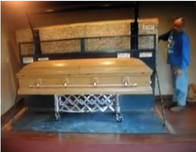
Trap Door Casket Lift at Full Raised Position

Please visit our Web Site ( wizardmfg.com ) to see this Lift in Motion